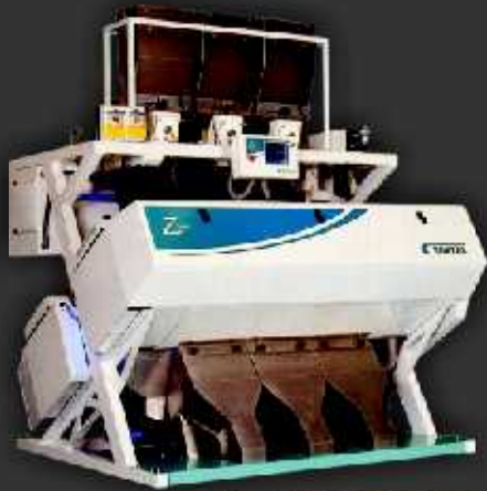
SORTEX MACHINE: Orders highest quality grades with 2048 sensor cameras

The process includes the use of Screen Separators, Destoners, to ensure that only the best grains reach the packaging stage. The use of specialised dryer assures optimal moisture, thus retaining the freshness and increasing the shelf life of the dal. The automatic weighing & filling machines at our plants allow us to pack our produce with precision.